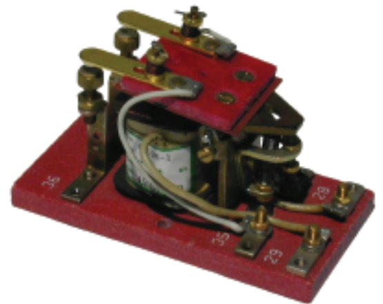
N130 Relay: 2 pole N.O.