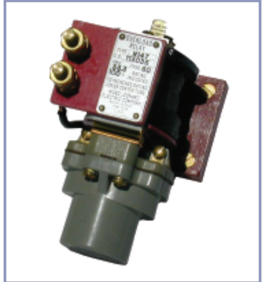
N147 Magnetic Overload Relay