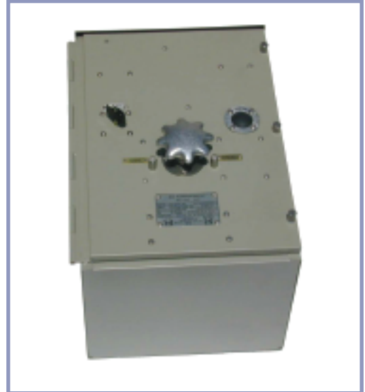
A.C. Automatic Bus Transfer, dripproof enclosure

*Can be furnished less enclosure for switchboard mounting.